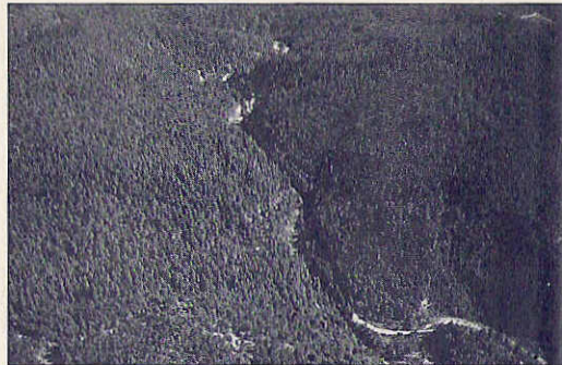
Allen Creek Grove in the Headwaters Forest

Ecofeminism does not seek to dominate men, as women have been dominated under patriarchy. It seeks only to