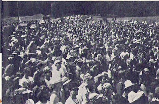
Crowd at Headwaters Forest rally

that we did not recognize it as revolutionary is one of the reasons we were so unprepared for the magnitude of the attack. If we are to continue, not only Earth First! but the ecology movement must adjust our tactics to the profound changes that are needed to bring society into balance with nature. One way that we can do this is to broaden our focus. Of course, sacred places must be preserved, and it is entirely appropriate for an ecology movement to center on protecting irreplaceable wilderness areas. But to define our movement as being concerned with "wilderness only," as Earth First! did in the 1980s, is self-defeating. You cannot seriously address the destruction of wilderness without addressing the society that is destroying it. It's about time for the ecology movement (and I'm not just talking about Earth First! here) to stop considering