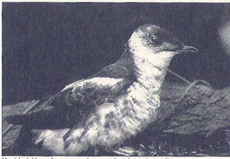
Marbled Murrelet, an endangered redwood species

trying to proclaim that my ideas are the Absolute Truth, or even that they represent a finished thought process in my own mind. These are just some ideas I have on the subject, and I hope that by airing them, it will spark more debate and advance the discussion.