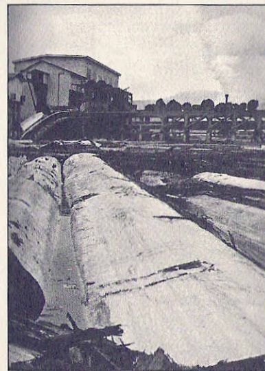
Floating logs at a mill

In other words, this system cannot be reformed. It is based on the destruction of the Earth and the exploitation of the