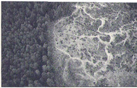
A clearcut in the Headwaters Forest

people. There is no such thing as "green capitalism," and marketing cutesie rain-forest products will not bring back the ecosystem that capitalism must destroy to make its profits. This is why I believe that serious ecologists must be revolutionaries.